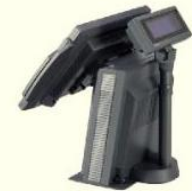
4) POS Terminal