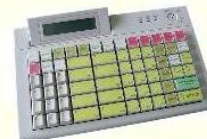
2) Simple keyboard terminal with customized firmware