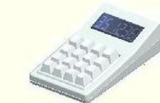
1) Simple keypad with customized firmware